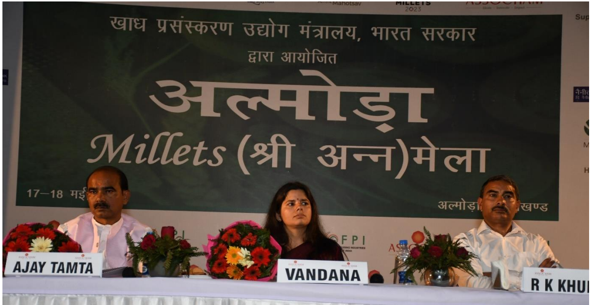
Mr. Ajay Tamta, Hon'ble Member of Parliament, Lok Sabha along with other dignitaries at the Inauguration Session

The main aim of the conference cum exhibition was to enthuse people for opting more Millet Based cropping systems; to promote Millet as a healthy alternative and enhance the infrastructure of Processing in the Almora region. The exhibitors demonstrated a wide range of millet-based processed food products with local crops grown in hilly areas. There was a footfall of around 1500 people on the two days of the conference cum exhibition.