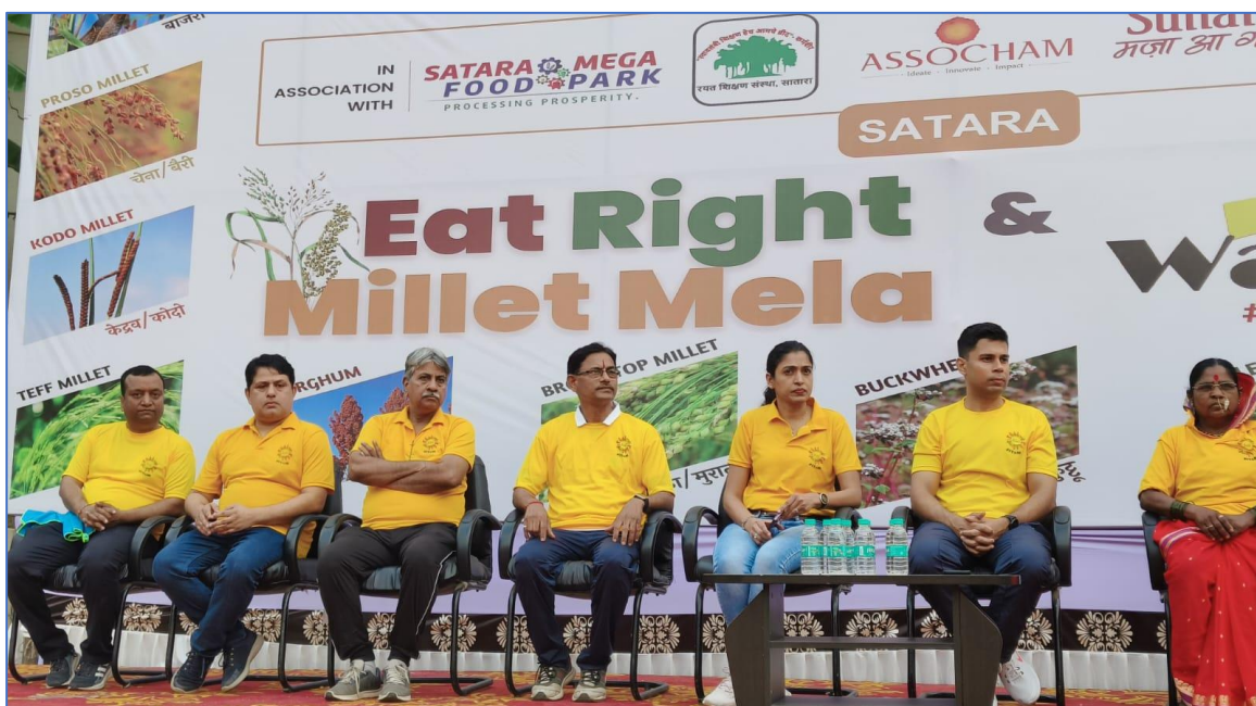
Padma Shri Awardee Ms Rahibai Popare (extreme right) along with other dignitaries graced the Inaugural Session

ASSOCHAM in collaboration with FSSAI, Satara Mega Food Park and Rayat Shikshan Sanstha, organised an Eat Right Millet Mela preceded by a Walkathon on 13 April 2023 in Satara. More than 1,500 people participated in the walkathon. At the millet mela, activities were conducted to create awareness about the health and nutritional benefits of millets including panel discussion, drawing, poster making, rangoli, quiz, recipe competition and cultural evening. The event also featured millet-based gaming kiosks, food company operators, and students displaying their products for sale and awareness. Padma Shri Awardee Rahibai Popare, popularly known as ‘Seed Mother’, also graced the programme.